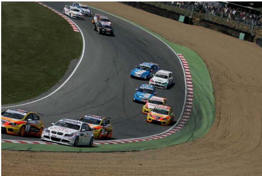
The FIA WTCC returns to Brands Hatch for the fifth consecutive year

In 2009 the second race was won by BMW's Augusto Farfus.